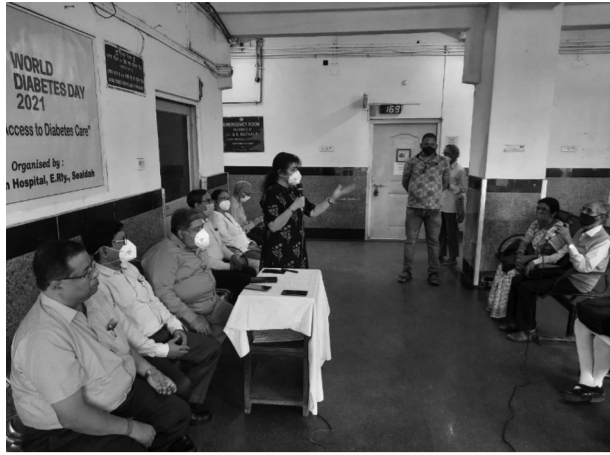
World Diabetes Day was observed today (16.11.2021) at B R Singh Hospital, Eastern Railway, Kolkata. PCMD/ ER, MD/B.R.Singh Hospital and other senior doctors of E.Rly graced the occasion. An interactive session with the audience was held emphasizing on life style modifications, early detection of diabetes & regular treatment